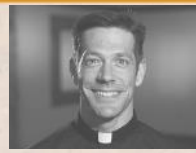
Fr. Mike Schmitz